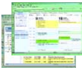
SCREENSHOTS FROM LOTUS NOTES 6